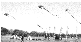
great kite photos at www.flygls.com

Make it a Family Day in Olcott! Sign up by June 6 and each child under 10 will receive 4 ride tickets for the Olcott Beach Carousel Amusement Park!